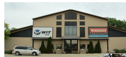
Winnebago Visitor Center Forest City

Friday- Forest City Saturday- Estherville Sunday - Northwood