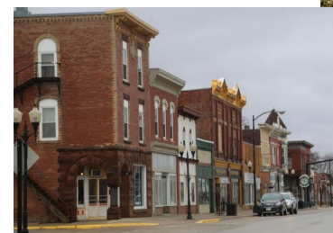
Central Av in Northwood